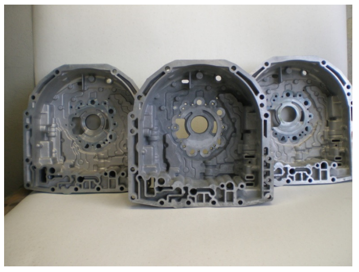
Fig. 5. Surfaces of collector cover at different stages of recovery

Figure 5 shows (from left to right) the surface of the part before recovery, with a sprayed surface and after machining.