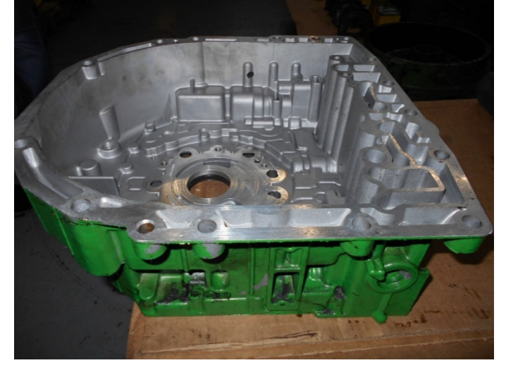
Fig. 3. General view of manifold cover

So, we have developed a technological process for repairing the cover of the John Deer 7830 transmission manifold (Figure 3). The defect of this part, which has the highest repeatability, is a strong wear and tear on the flat working surface of the oil pump attachment (Figure 4). The reason for such failures is the ingress of metal particles from the collapsed bearings under the pinion.